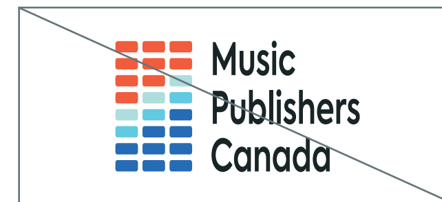
Do not distort or warp