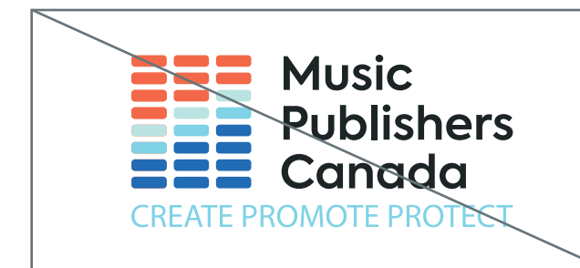
Do not add other elements