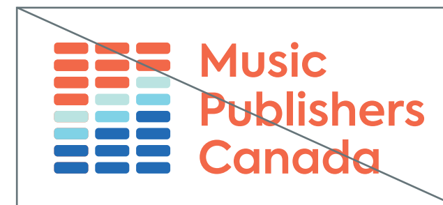
Do not change colours